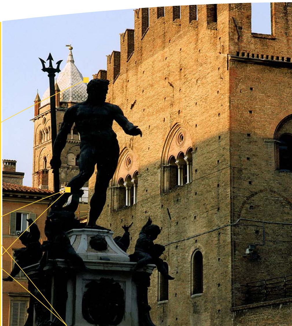
Bologna - Italy