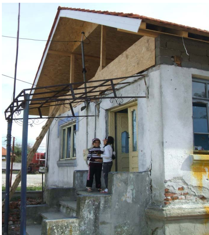
ROI project: one of the houses restructured in Romania with the help of micro-credit

In addition some families have been long-present in Bologna and have been living in campers for years. These come from reception camps and, earlier still, from the expropriation of agricultural land, purchased by them, for the purpose of building a residential area. The Roma population present in Bologna consists mainly of Romanian immigrants and former refugees from ex-Yugoslavia. Those who succeeded over the years in entering an equipped camp (First Reception Centre for refugees or transit camps known as Temporary Social Residences) were then inserted in programmes of social inclusion and integration, culminating in the Extraordinary plan of action to overcome emergency reception situations set up in 2007-08. Those excluded from this circuit set up camp in unauthorized settlements on the outskirts, near the ring road, along the banks of the River Reno, in unused areas of countryside. A large number of baracchine (the Roma people's own name for these encampments) can still be seen today in these areas. At present this phenomenon appears to involve 11 extended family groups.