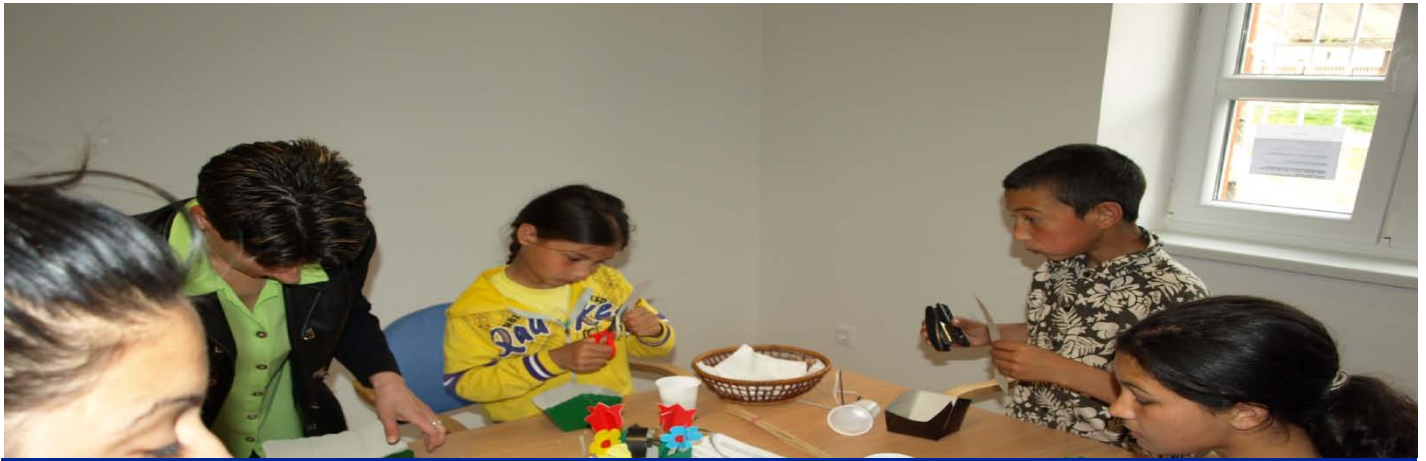
Nagykálló - Hungary